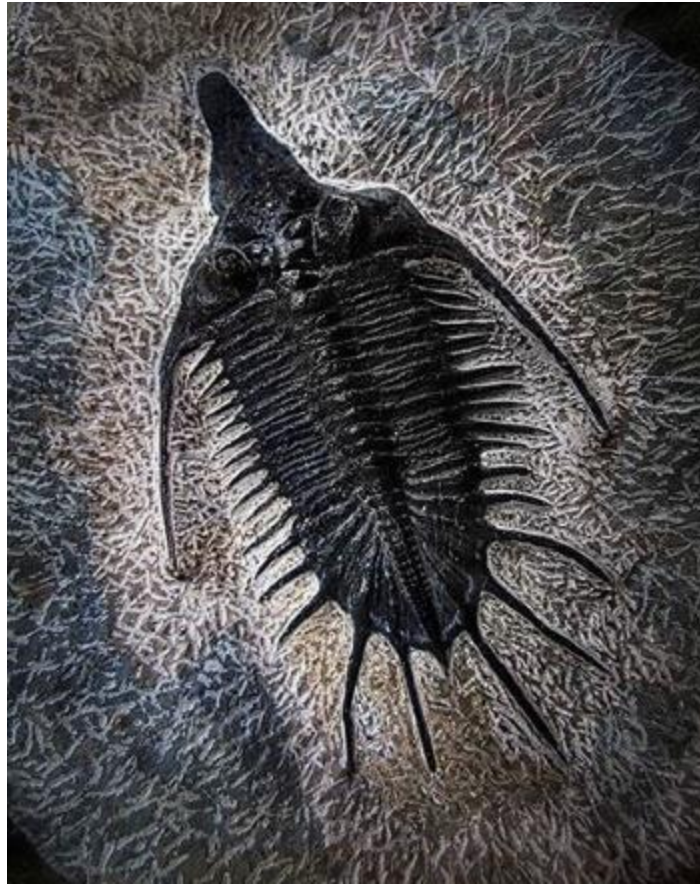
Image (above) from photographer Art Murphy's "Trilobites Drawing Series." https://artandfossils.wordpress.com